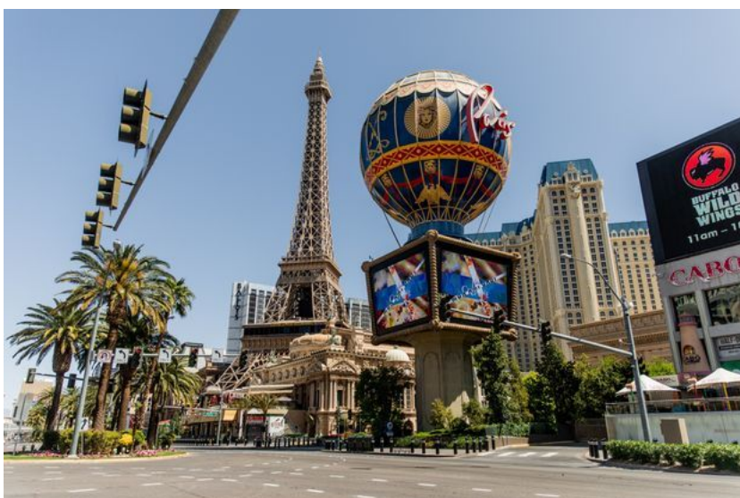
The closed Paris Las Vegas Hotel & Casino, last month.

These characteristics allow credit unions to offer more customized services to their members. But their customers can also simultaneously suffer mass layoffs.